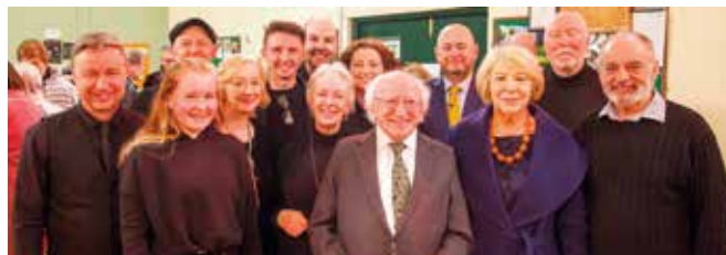
Above shows President and Mrs Higgins with the cast of 'All That Fall' in Tullow Parish on 23rd March this year.

The naming of the village green after Samuel Beckett in 2014, following its refurbishment and installation of two granite benches engraved with the name of two of the playwright's best-known plays 'Waiting for Godot' and 'Come and Go', led to Dun Laoghaire-Rathdown County Council including a series of Foxrock Beckett Country Walks in its Summer Heritage Programme every year since.