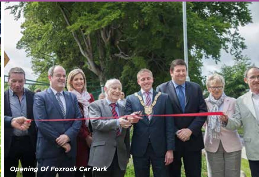
Opening Of Foxrock Car Park